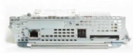
Figure 3 Content Engine Network Modules

The Cisco ® IDS Network Module is part of the Cisco integrated intrusion detection system (IDS) network security solutions that enable organizations to protect assets and reduce operating costs.