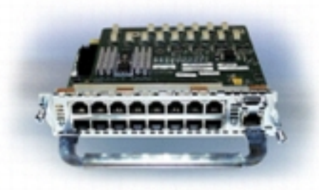
Figure 2 16-Port Etherswitch Network Module

Cisco's Content Engine Network Modules offer the industry's first and only router-integrated content-delivery system. Combining intelligent caching, content routing, and management with robust branch-office routing conserves WAN bandwidth for important branch IP services such as voice over IP (VoIP), while simplifying configuration, deployment, and operation.