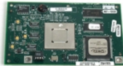
Figure 6 VPN/EPII Encryption AIM

The AIM-ATM provides a high-performance hardware-based ATM access solution for one to four T1 or E1 connections supported by the T1 or E1 VWICs (for example, VWIC-1MFT-T1). This frees the network module slot to support other functions. When used in combination with a high-density voice network module (NM-HDV-xxx), the ATM AIM supports ATM adaptation layer (AAL) 2 and AAL5 VoATM. In addition, the AIM-VOICE-30 and AIM-ATM-VOICE-30 AIMs provides a cost effective solution for supporting voice services or digital voice over ATM (AAL2 and AAL5) support, without the use of a network module (refer to Appendix C for the complete list of supported AIM modules for the Cisco 2600 Series).